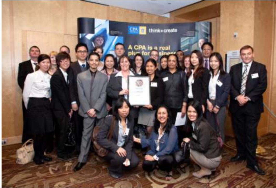
The Secure Parking Finance Team at the Award Ceremony on 23 September 2011 in Sydney

You are receiving this email as a current member of the Parking Association. If you do not wish to receive this information in future, please email us and we will remove your details from the mailing list.